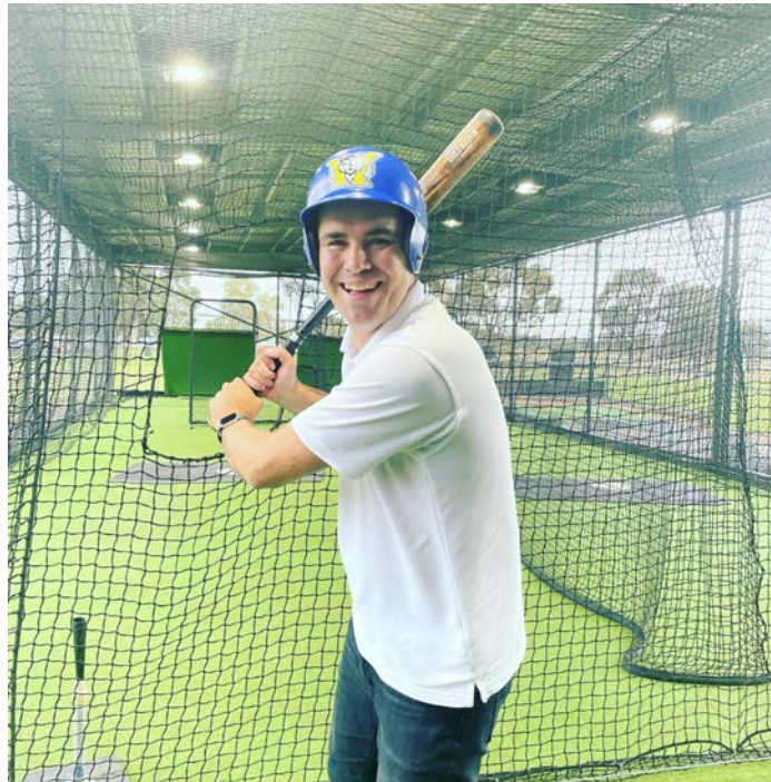
Tim Watts MP for Gellibrand