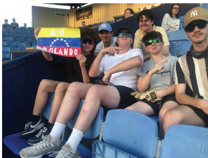
All Star Cheer Squad